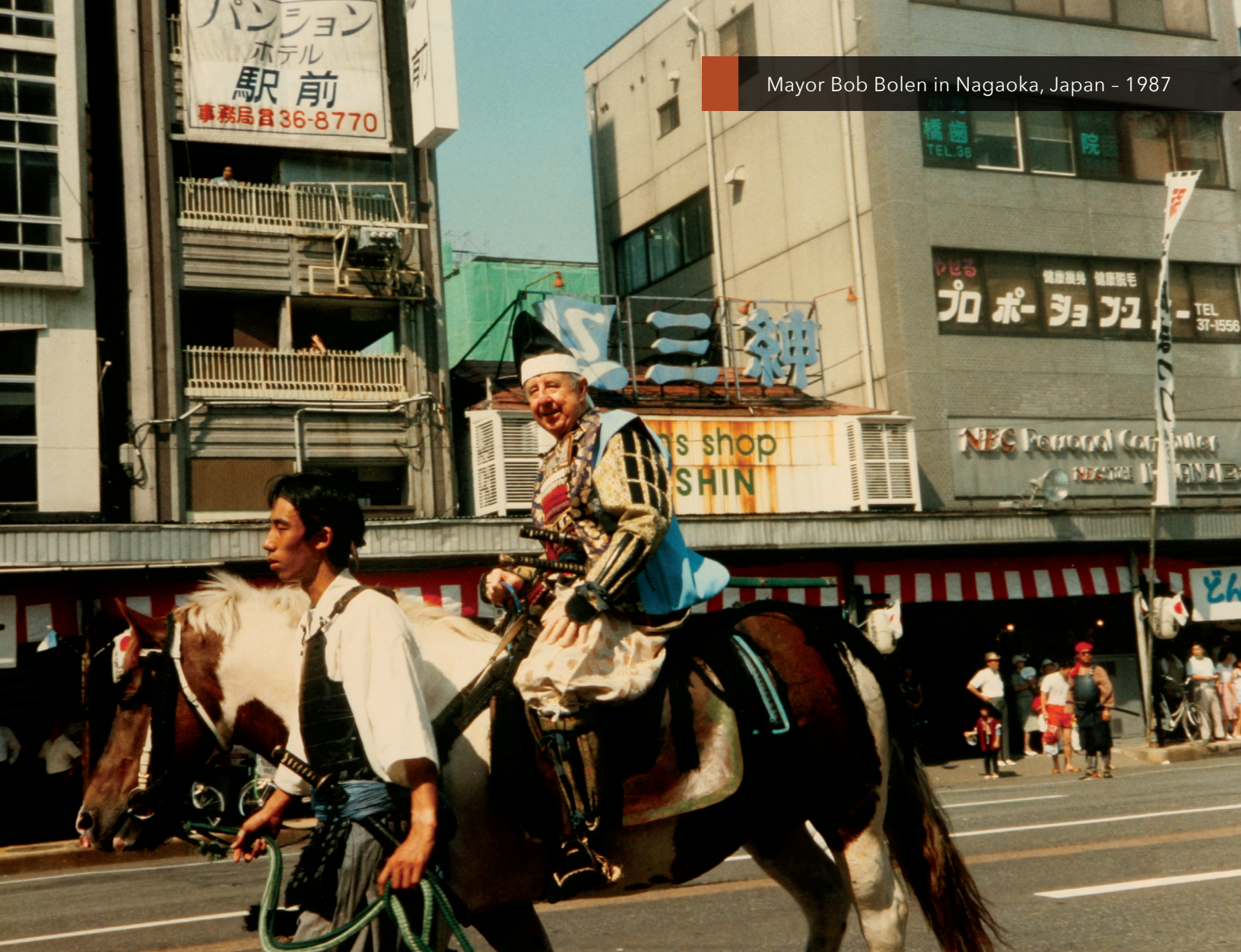
Mayor Bob Bolen in Nagaoka, Japan - 1987