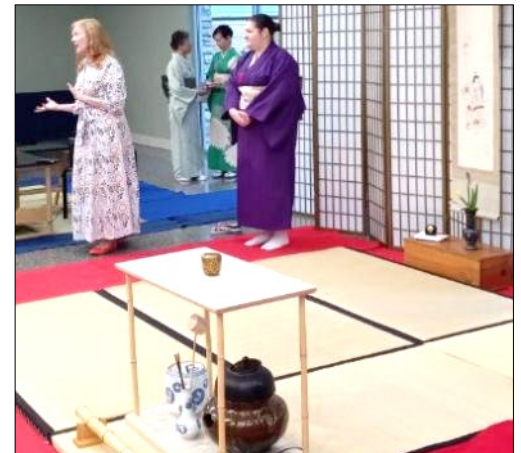
FWJS members assisting with the 2026 Spring Festival Tea Ceremony