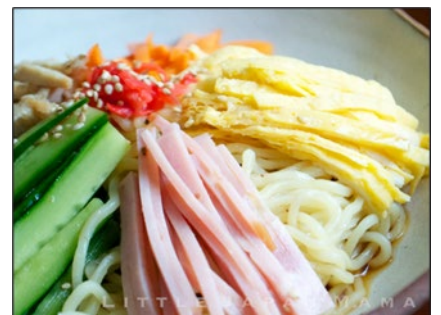
Refresh with Hiyashi Chuka Soba at our June luncheon