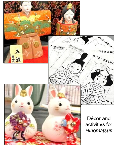
Décor and activities for Hinomatsuri