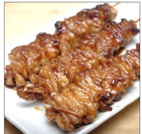
Enjoy warm yakitori/vegitori with potato salad and rice at May luncheon