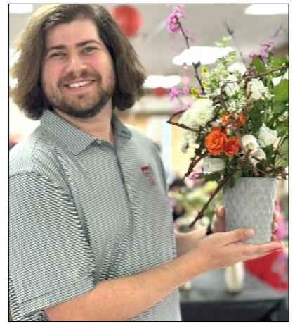
A lucky raffle winner of Ikebana floral arrangement at March luncheon—Go, Raiders!

日本の星祭りを居酒屋スタイル（日本のパブ）の食べ物で祝うセタランチョンを今からカレンダーに書き込んで下さい。次の会報でもっとお知らせします。